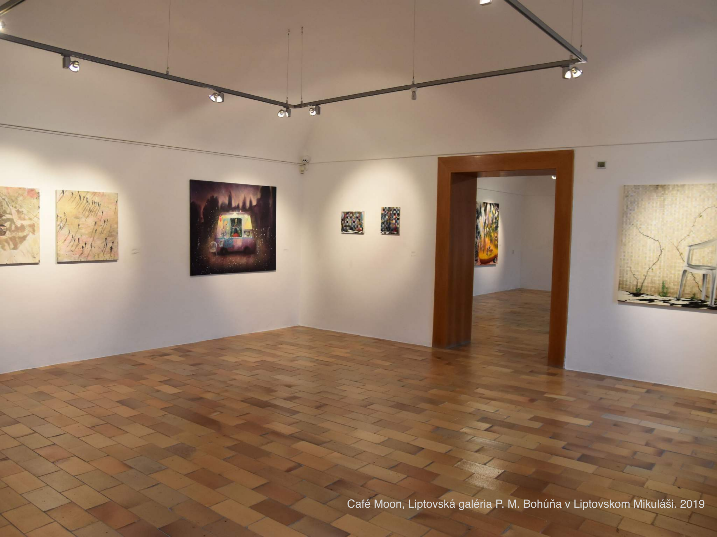
Café Moon, Liptovská galéria P. M. Bohúňa v Liptovskom Mikuláši. 2019