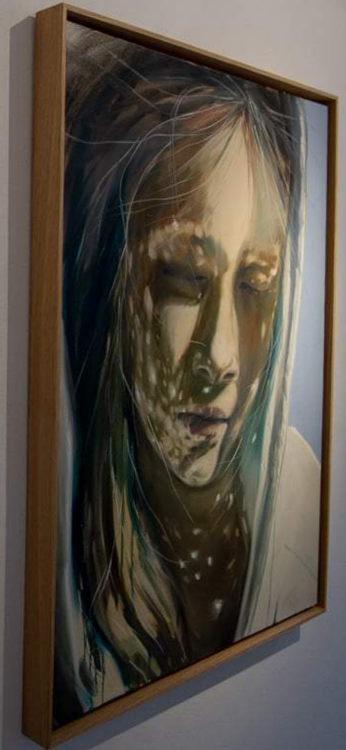
Endless Wonderers, Dub Gallery, 2020