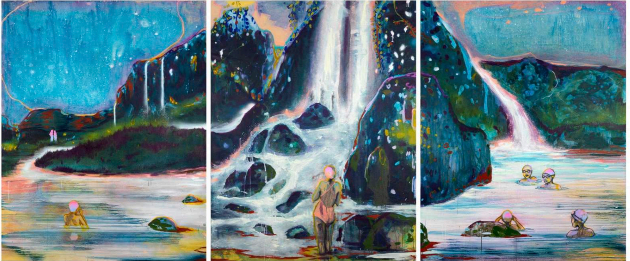
Girls from blue hills 190 x 450 cm Acrylic on canvas, 2020