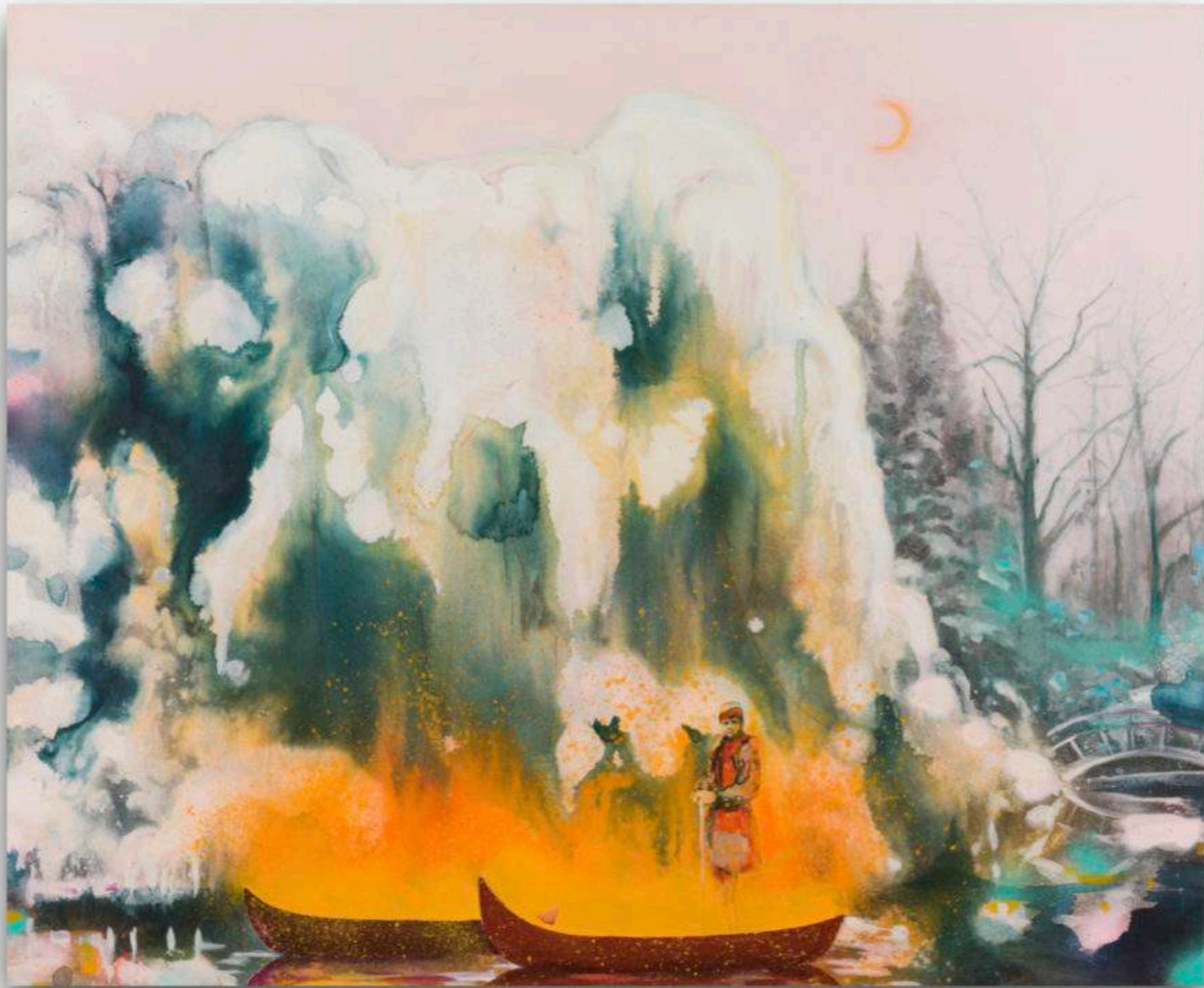
The guardian of the frozen hill.. 90 x 110 cm Acrylic on canvas, 2018